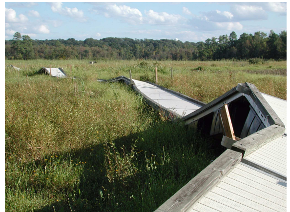
Right: The damaged Boardwalk.