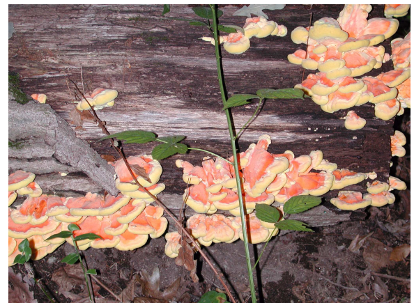
Right: An interesting shelf fungus growing on a rotting log beside the trail to the boardwalk.