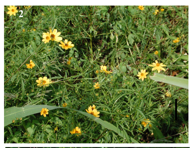
2. Tickseed sunflowers ( Bidens coronata ) along the boardwalk