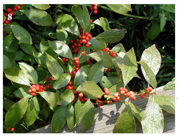
8. Winterberry Holly ( Ilex verticillata ) at the edge of the wetlands

9.Partridge pea ( Chamaecrista fasciculata ) growing in the wetlands