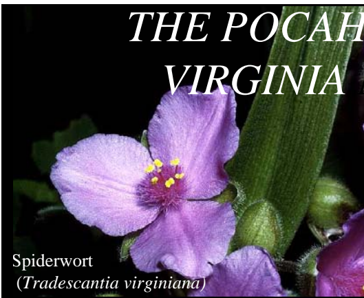
Spiderwort ( Tradescantia virginiana )