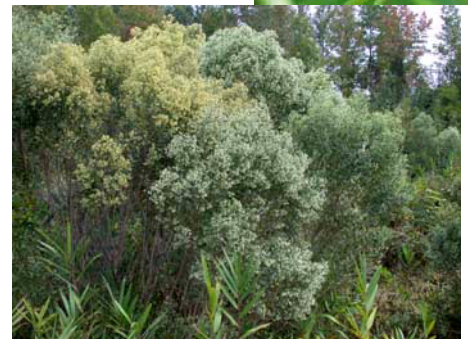
Groundsel trees in flower - male plant (yellow) on the left, female (white) on the right