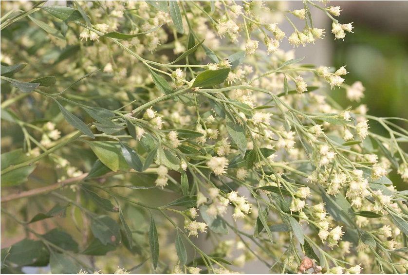
Groundsel tree in bloom