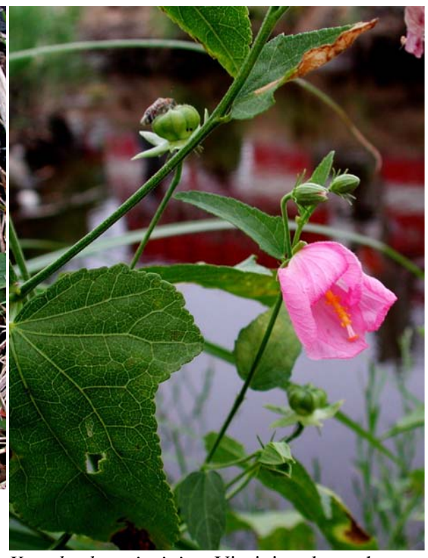
Kosteletzkya virginica, Virginia saltmarsh mallow

Pocahontas Chapter Virginia Native Plant Society 12565 Brook Lane Chester, VA 23831