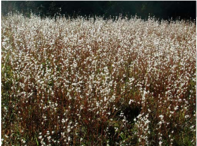
A field of Little bluestem grass ( Schizachyrium scoparium ) with detail of seeds in photo above.