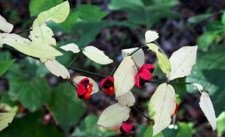
Strawberry Bush or bursting-heart ( Euonymus americanus ) with fruit. The leaves turn white or pale pink in the fall