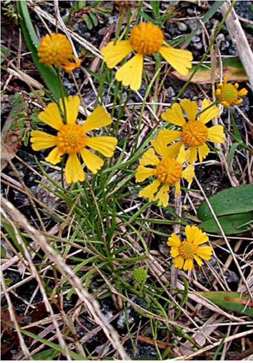
Fine leaved sneezeweed or yellowdicks ( Helenium amarum )