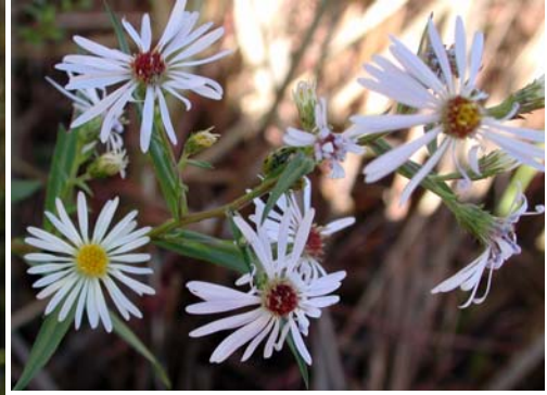
Above: Asters in bloom in the wetlands beside the boardwalk.

Far Left: Botrychium virginianum , rattlesnake fern.