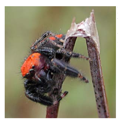
Left: An orange and black spider on a dogbane stem waiting for dinner