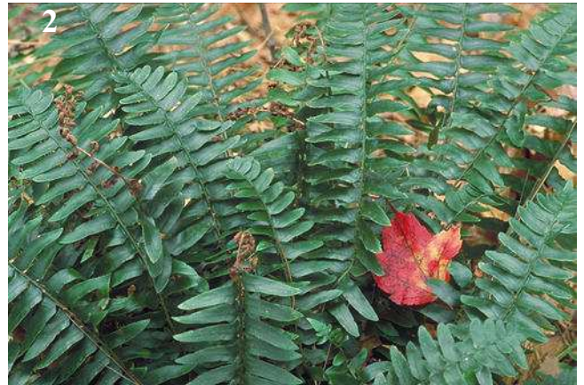
Above: Christmas fern close up.

Right: Fertile frond - The smaller leaflets at the top are the spore bearing leaflets.