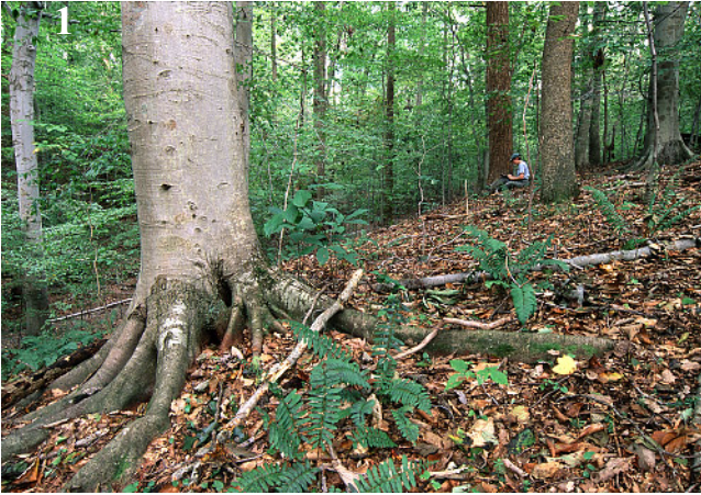
Christmas fern growing on a bank around a beech tree