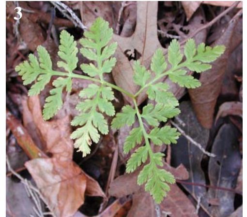
Three Grape Ferns, 1 and 2 probably Botrychium dissectum , 3 probably Botrychium virginianum .

4. A Pawpaw patch. The paw-paw, Asimina triloba , leaves had turned yellow and were falling.