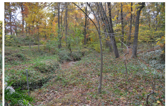
Left: Our group at the start of the pull. Center: Before we started.