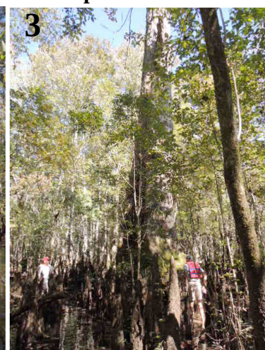
3. "Big Mama," a bald cypress, was Virginia's largest tree at 123 feet before she died.