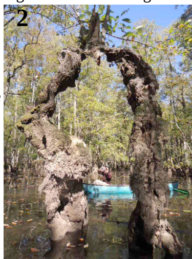
2. Water tupelos hollow (to the extreme) as they age and often have a diverse plant community growing on the skeletal looking live tree.