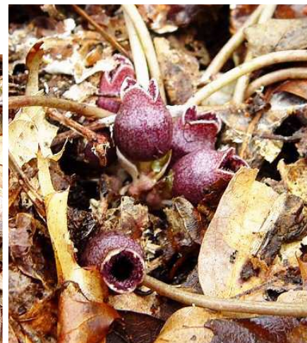
Above: Hexastylis flowers. Right: Asarum canadense with flower.