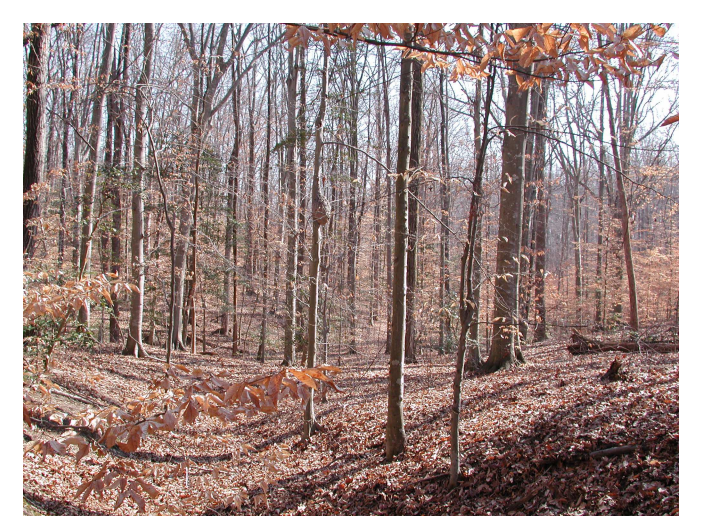
Another view of the forest. Note the large hornet's nest in the middle of the photo.