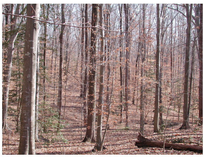
The Forest. Note the open, park-like appearance.