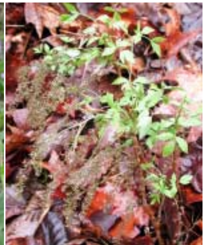
Yellowroot ( Xanthorhiza simplicissima ), an unusual woody member of the buttercup family was growing along the river bank.