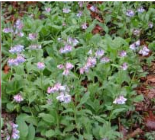
Bluebells ( Mertensia virginica ) were found in large numbers near the river. There was also an occasional white bluebell. See right photo above.