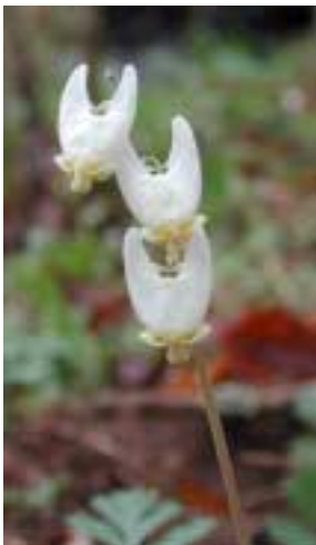
Dutchman's breeches ( Dicentra cucullaria ) was found near the Bluebells

Rain was threatening as we left Richmond, and when we got to Monticello it was raining lightly, but we were assured by our guide that we would go unless there was a downpour or thunder. The rain stopped as we left the parking lot and walked up to Jefferson's cemetery. From there we walked along roads and trails Jefferson used, down to the Rivanna River where there were lots of trout lilies, and bluebells in bloom. There was much to see. Redbud trees, sassafras and lots of other plants were also in bloom.