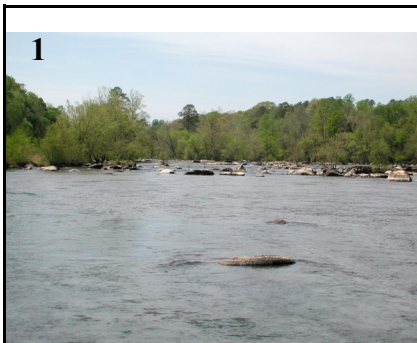
Ferndale Park: 1. The River 2. Veronia noveboracensis , New York Ironweed 3. Monarda punctata , Horsemint