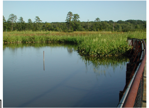
Point of Rocks Park - Along the Boardwalk.