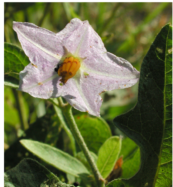
Point of Rocks Park - Solanum carolinense , Horsenettle.