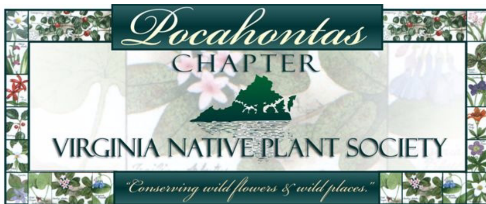
Our new Chapter Banner

The board has been working hard to line up a variety of field trips and speakers. Some of the walks and speakers will compliment each other, some are independent. The events calendar will announce our monthly activities. It will be updated throughout the year as more possibilities come our way.