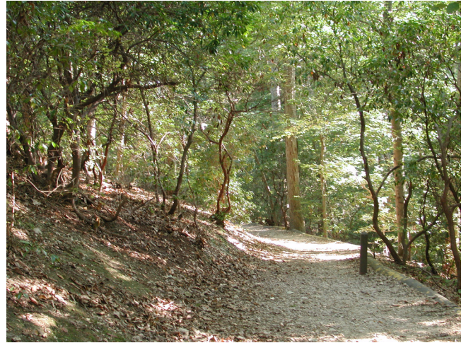
Point of rocks Park - Walking down the hill to the boardwalk through a patch of mountain laurel.