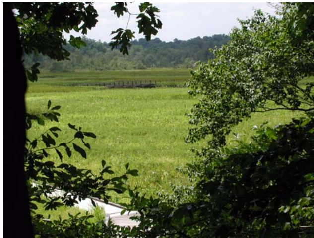
Ashton Creek Marsh

The park is in eastern Chesterfield County on the Appomattox river. Initially a moderately steep trail leads down to a boardwalk which goes over Ashton Creek Marsh, then the trail follows the Appomattox river through a forested area, then through a meadow and back up to the parking area.