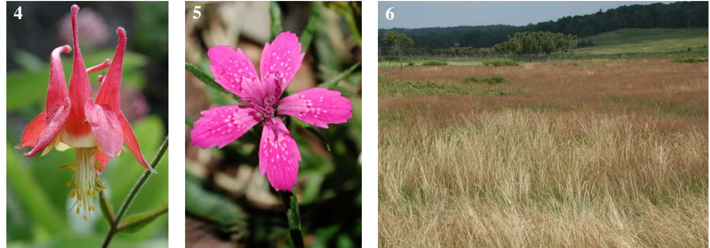
4. Columbine (Aquilegia canadensis) 5. Deptford pink (Dianthus armeria) 6. Looking across the Meadow at Big Meadows.