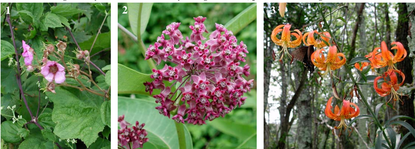
1. Purple flowering raspberry ( Rubus odoratus ) 2. Poke milkweed ( Asclepias exaltata ), 3. Turk's Cap Lily ( Lilium superbum ).